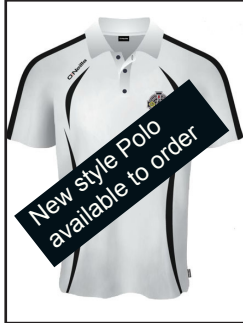
Polo Shirt (White)

Please note: All items MUST be paid in full at time of order. No exceptions