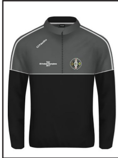
Squad Top (half zip)